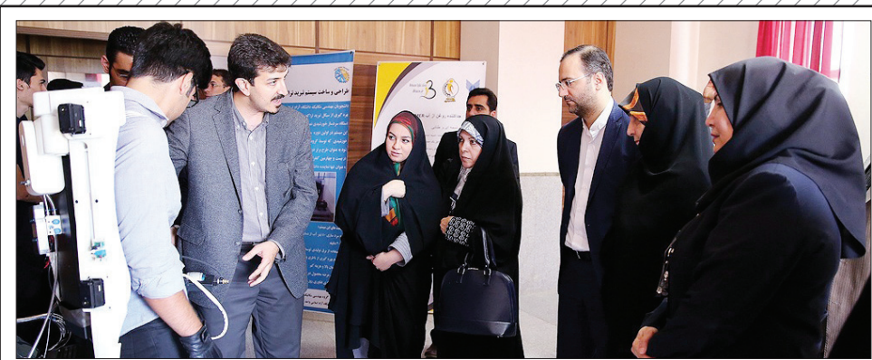
SATURDAY, JULY 23: IAU'S COUNCIL OF EDUCATED WOMEN VISITED PARDIS BRANCH.