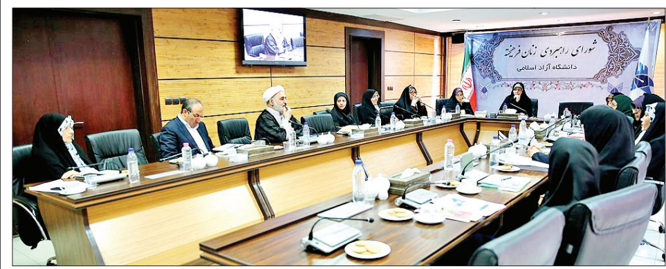
SUNDAY, JULY 17: IAU'S COUNCIL OF EDUCATED WOMEN HELD ITS MEETING.

produced through electrospinning; then, alternate amounts of graphene nano-plates and graphene oxide were added to the nano-fiber and the effective setting for synthesizing the final scaffold was determined. And then, through testing the conductivity, biocompatibility and the mechanical properties of the product, the best scaffold for cell culturing was selected. Finally, the chosen scaffold was used for cell culturing and its performance in terms of multiplication and differentiation of the cells was evaluated." According to the findings of this project, adding graphene nano-plates to the scaffolds increases their electrical conductivity and direction, which leads to the increase in their cell differentiation.