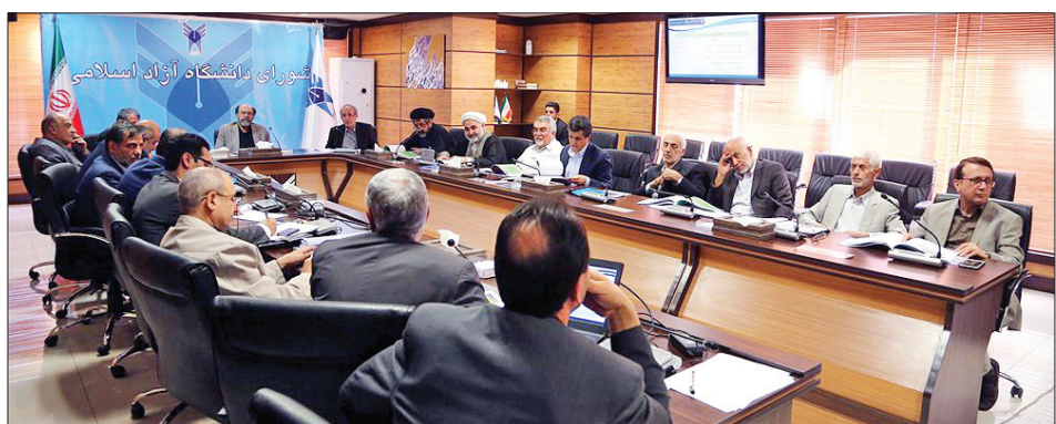
SUNDAY, JUNE 26: MEETING OF THE ISLAMIC AZAD UNIVERSITY'S COUNCIL.

Founded in 1954, IFP School is part of the IFP Energies Nouvelles, French Institute of Petroleum, a French public-sector research and training center, which collaborates with the universities in different parts of the world in master and doctorate levels.